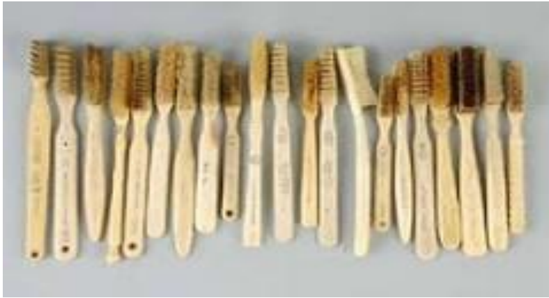
Figure 2: Different type of earlier toothbrushes designs [2]