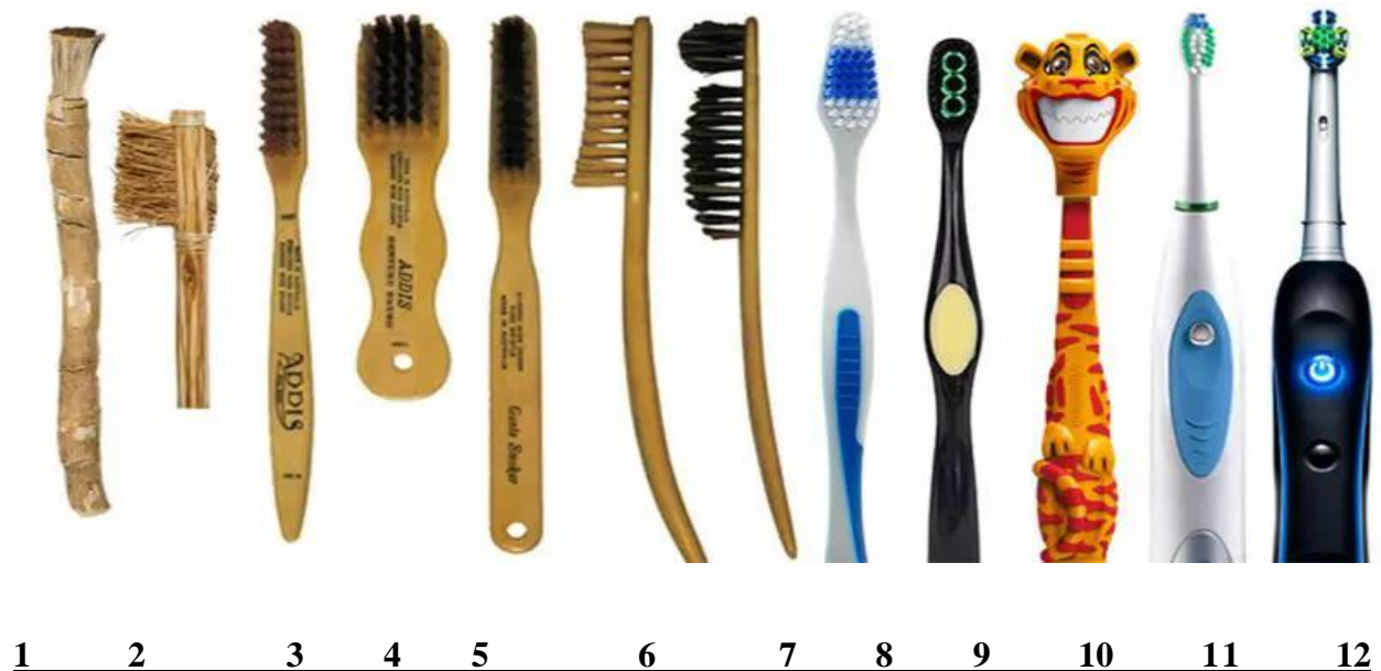
Figure 4: The Evolution of Toothbrushes [4]